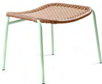
caramel brown/pastel green 00ACFS-7