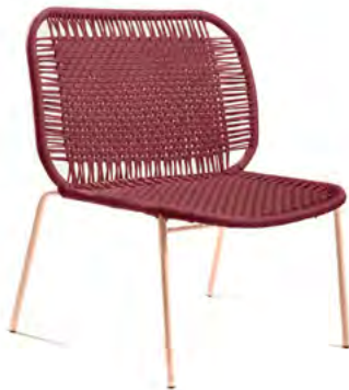
red/pink sand 00ACLC1-5