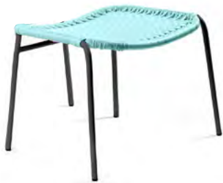
light green/black 00ACFS-2