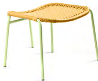
honey yellow/pastel green 00ACFS-6