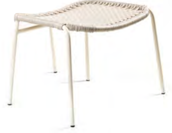
winter grey/pearl white 00ACFS-9