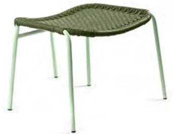
olive green/pastel green 00ACFS-4