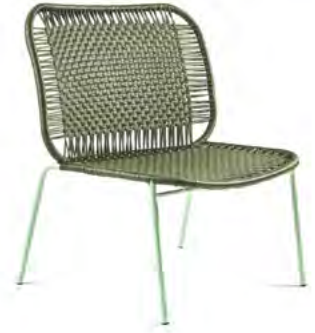
olive green/pastel green 00ACLC1-4