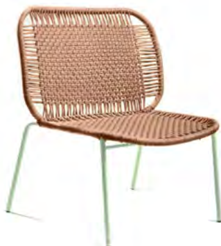
caramel brown/pastel green 00ACLC1-7