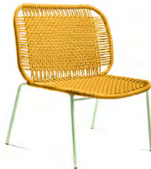
honey yellow/pastel green 00ACLC1-6