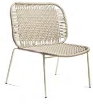
honey yellow/pastel green 00ACLC1-9