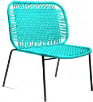
light green/black 00ACLC1-2