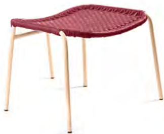
red/pink sand 00ACFS-5